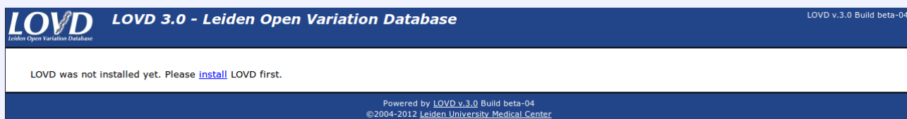
Figure 2.1: When pointing your browser to the LOVD location, it will tell you it's not installed yet. Click the link to start the install process.

Next, point your web browser to the directory where you've uploaded the LOVD files. This could, for instance, be http://localhost/LOVDv.3.0/ or http://www.your-domain.org/LOVD/ . LOVD will tell you it's not installed yet, and include a link to the install directory.